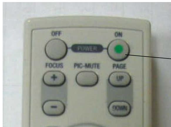
Switch ON the Projector

3. Switch on the Projector – select the button ON from the remote control of the Projector - Fig.2.