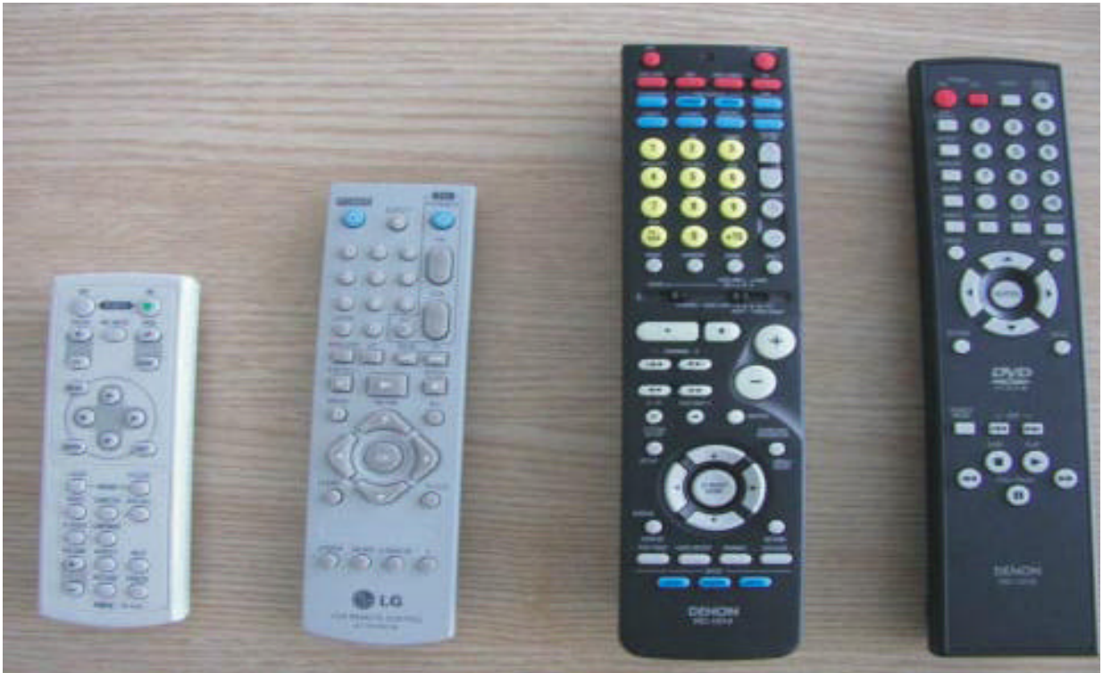
Remote control for the NEC Projector

2. Take out the necessary remote controls of the devices - Fig.1.