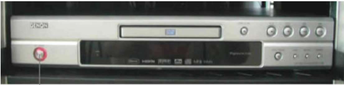
Switch the DVD player ON/OFF